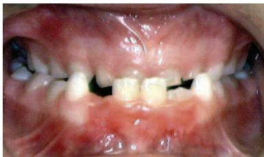
COMPLETE CLASS III